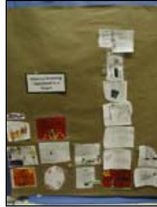
Graphic representation of their categories of their memories about measurement.

Students were curious about the experiences of their peers. Many students developed questionnaires to poll their classmates: