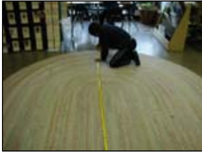
How long is the carpet?