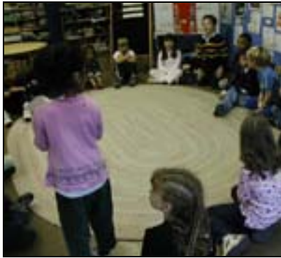
Students discuss how to categorize their memory drawings.