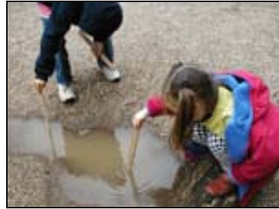
How deep is the puddle?

Teachers planned for the project by brainstorming major concepts and big ideas that they felt were essential for students to understand. These big ideas included: