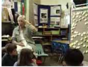
The teacher is telling children to categorize by similarities.

To encourage students to think further about their previous experiences with measurement, teachers shared personal stories. The head teacher described a special wall in her kitchen that recorded heights of all the family members. Several children told of their experiences with measuring. Children wrote and drew about their personal experiences.