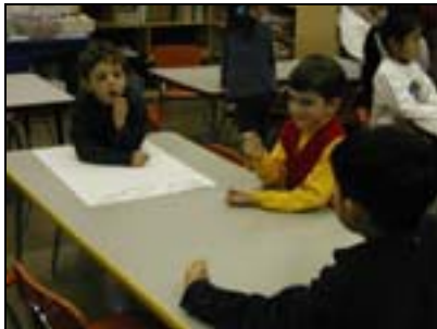
Students discuss what is difficult about measuring solids.

During large group discussion, several students mentioned problems they had while measuring something. The teacher asked students with similar problems to get together in small groups to discuss the difficulties they had measuring.