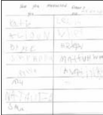
Questionnaire asking classmates, "Have you measured flour?"