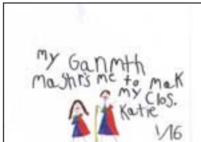
"My grandma measures me to make my clothes."

To encourage students to think further about their previous experiences with measurement, teachers shared personal stories. The head teacher described a special wall in her kitchen that recorded heights of all the family members. Several children told of their experiences with measuring. Children wrote and drew about their personal experiences.