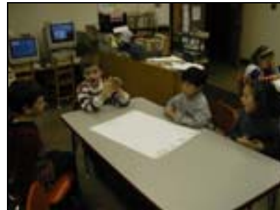
Students discuss what is difficult about measuring the length of things.

The comments from the group discussing solids included: